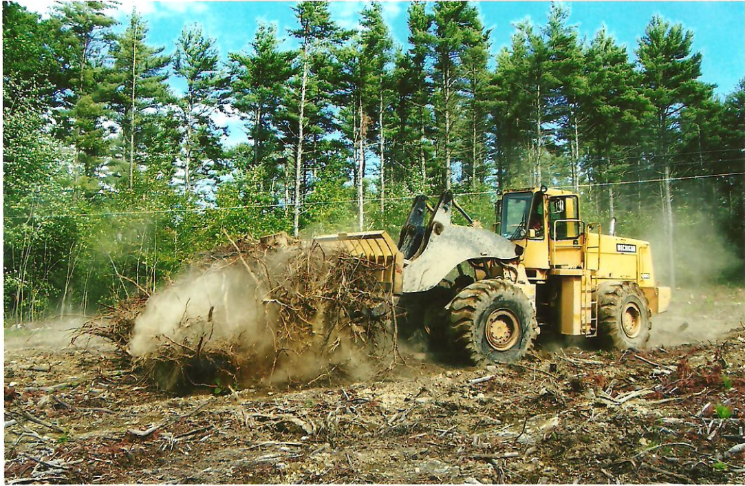
Aug 22 nd , 2005: Steve Pushing Another Pile Of Stumps.