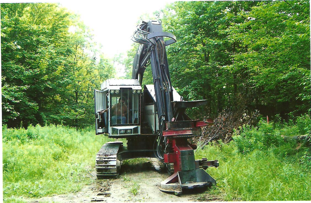
July 14 th , 2005: Logging Gets Underway