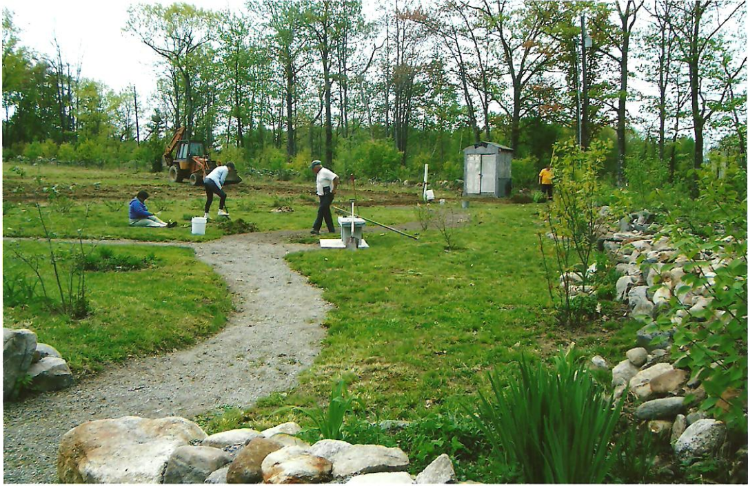
May 2006: Volunteer Work At The Memorial Garden Is Continuous