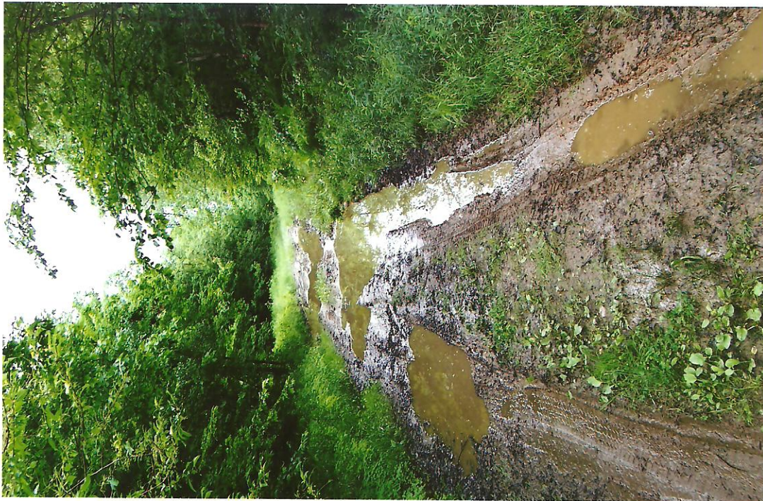
June 14 th , 2005: Rufus Colby Road - Cemetery Entrance On Right