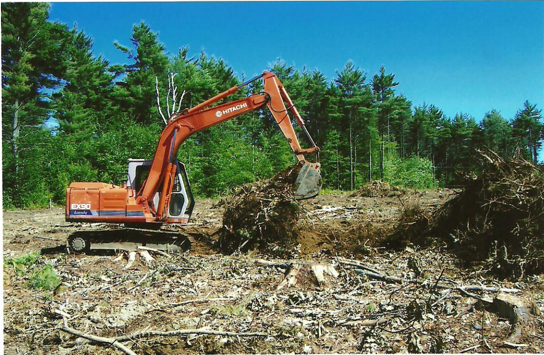
July 24 th , 2005: At Least The Ground Is Dry.