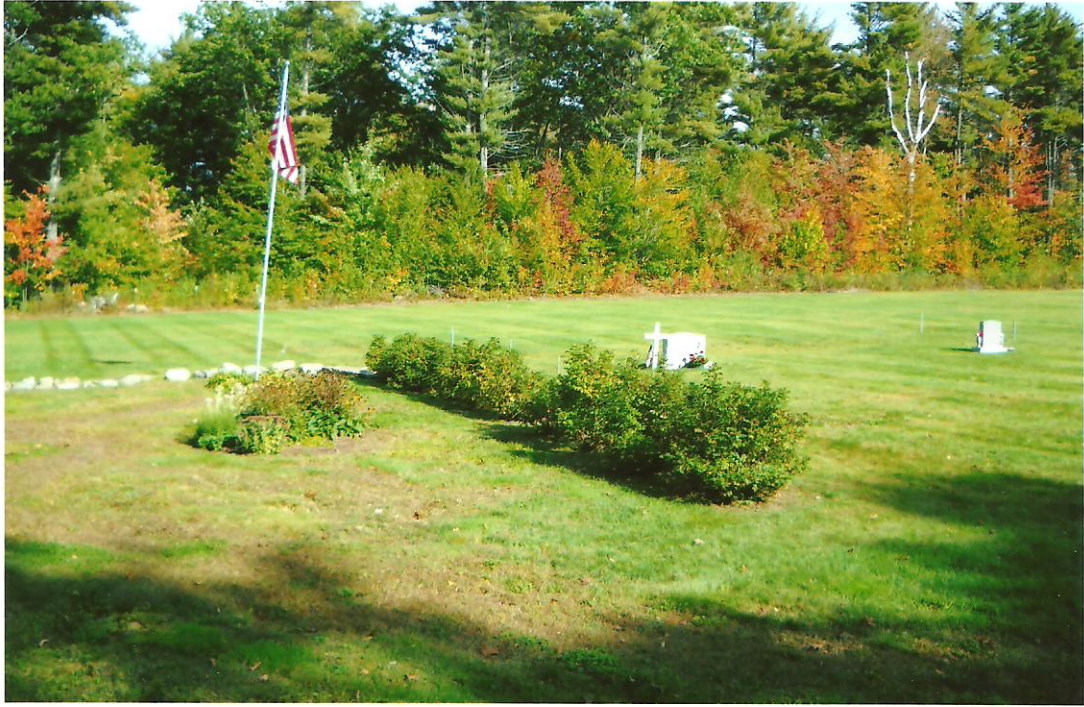
General Shots Of The Cemetery