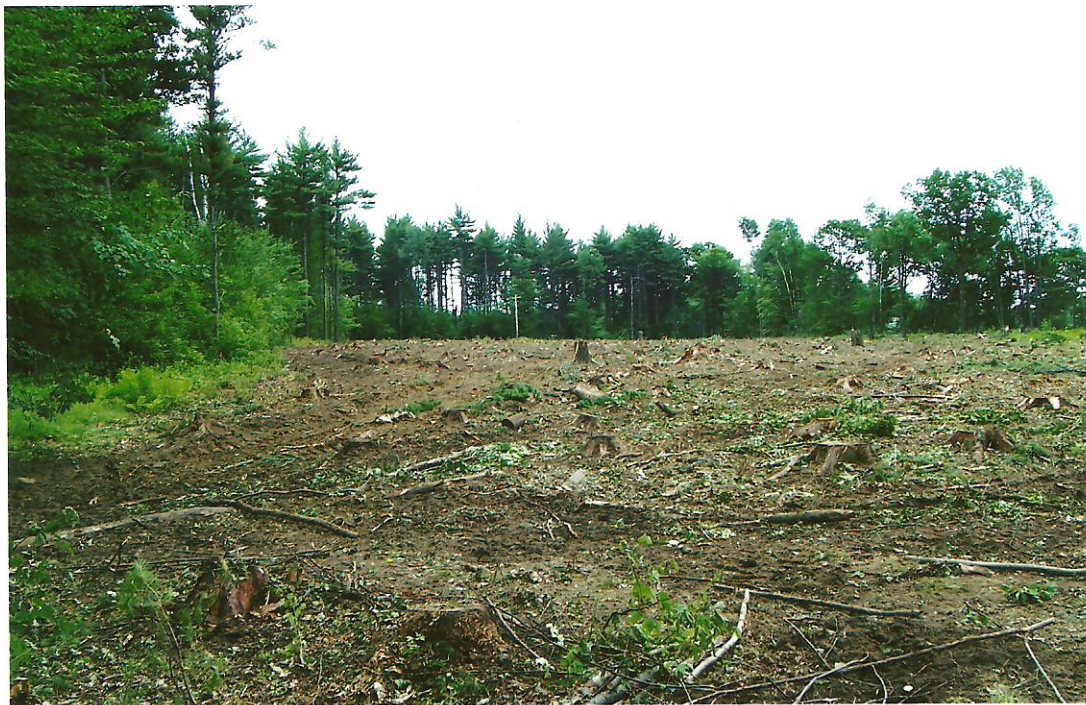
July 22 nd , 2005: One Month Of Exhausting Work Completed.