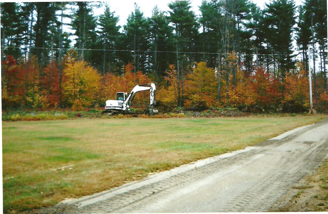
Digging The Remaining Stumps That Were Not Done in 2005