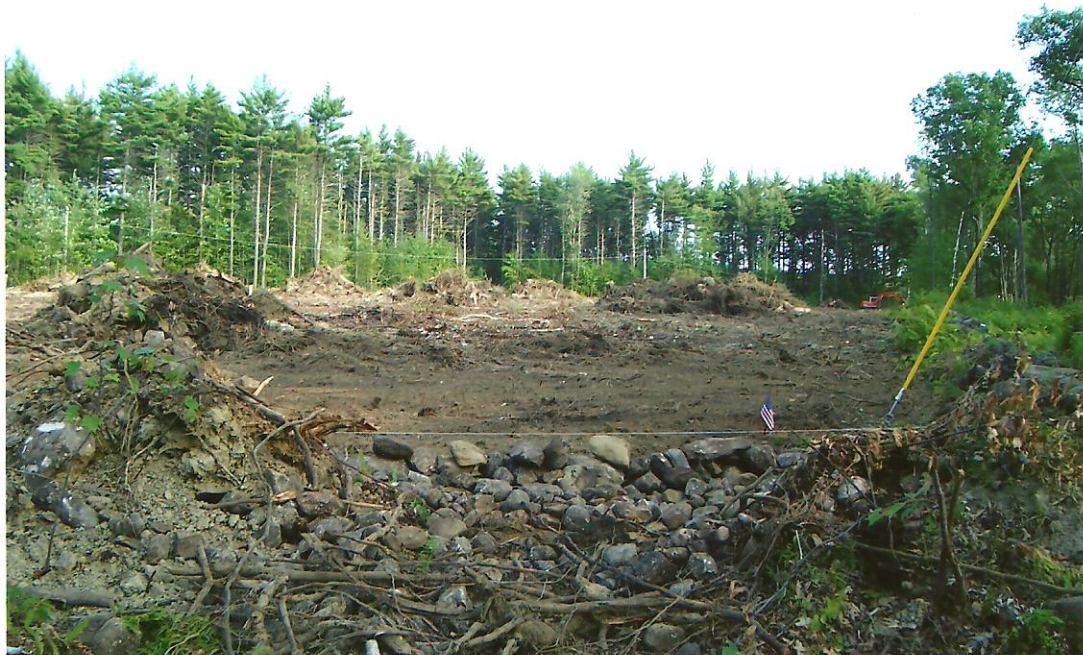
Aug 22 nd , 2005: Peter Continues to Build The Entrance