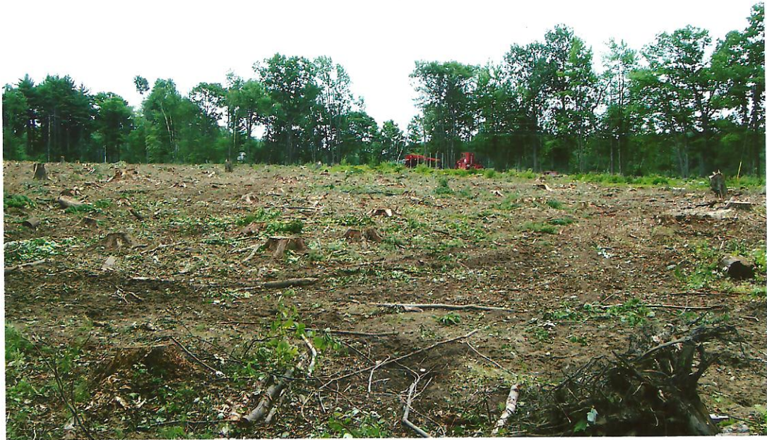
July 22 nd , 2005: Logging Equipment Leaves The Site