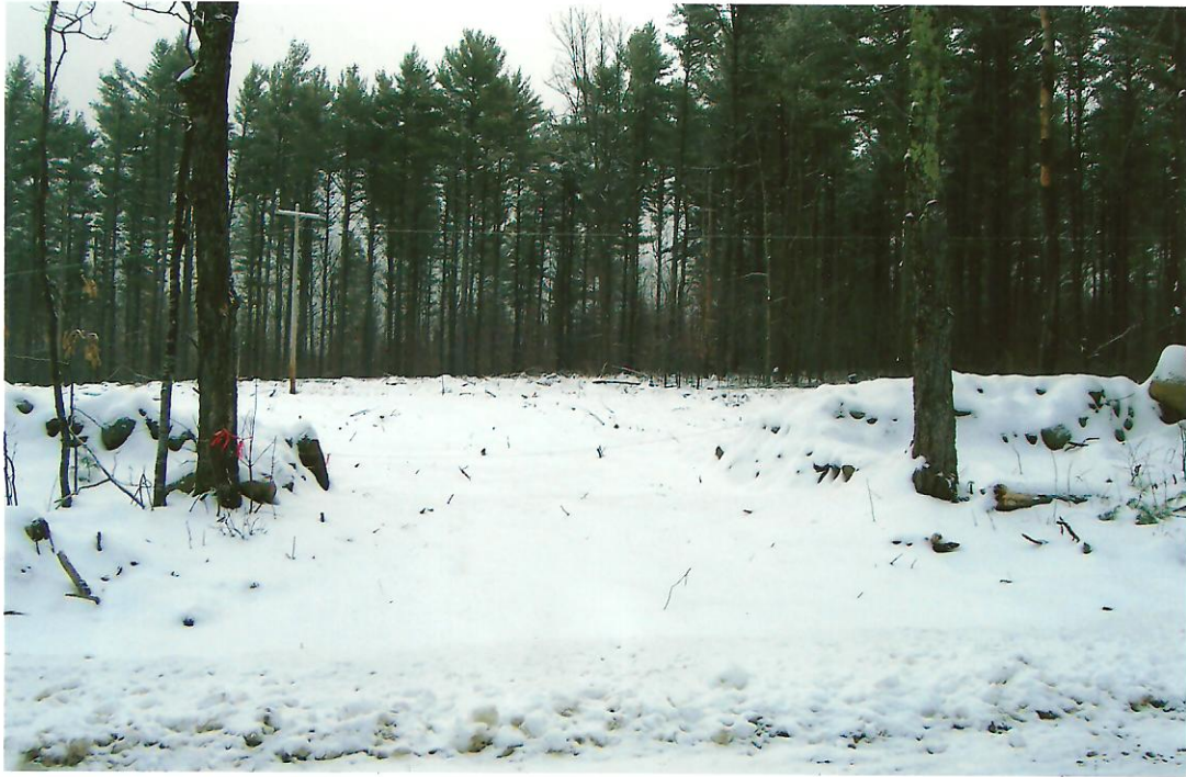
Jan, 2006: Winter Is Setting In So No More Work Until Spring