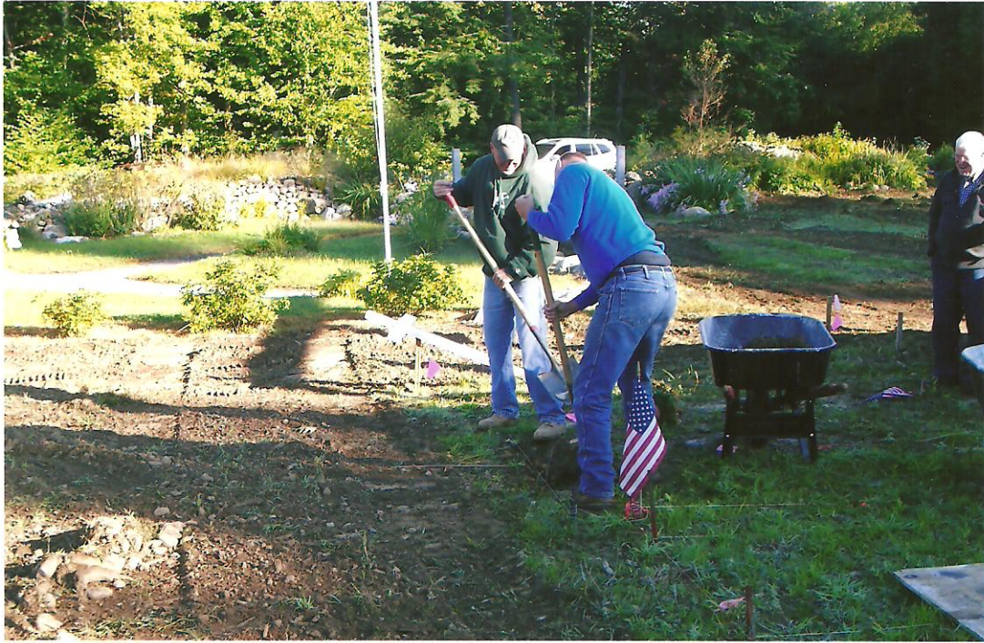
Aug, 2008: Putting In The Headstone Base