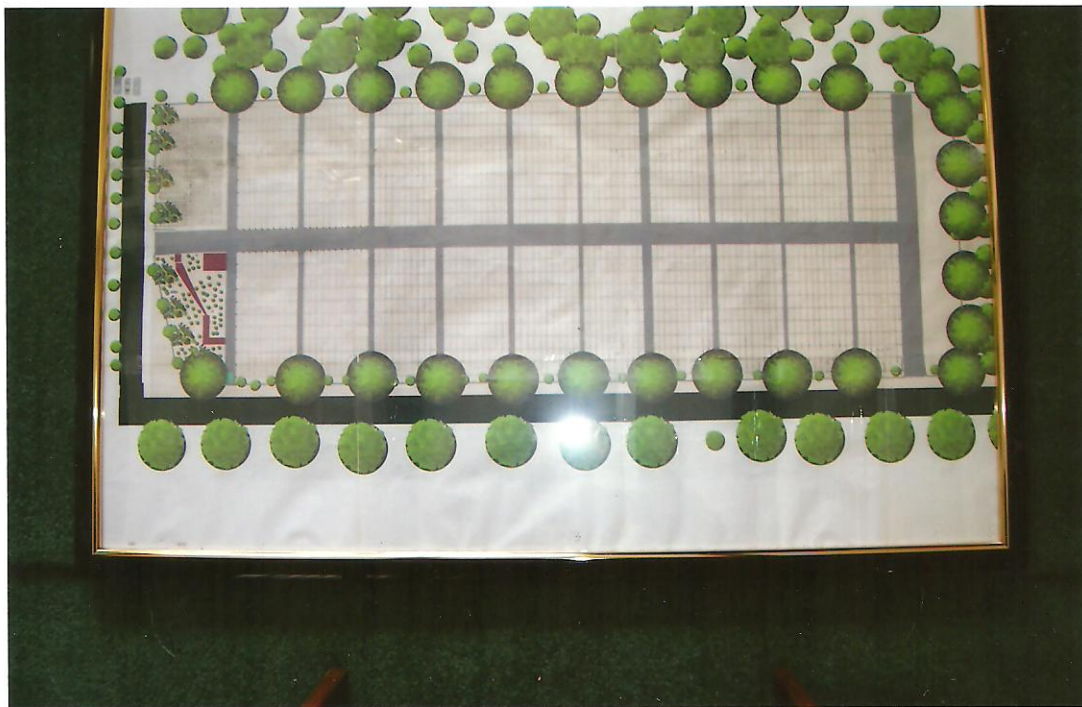
A Computerized Overview Of The Finished Layout