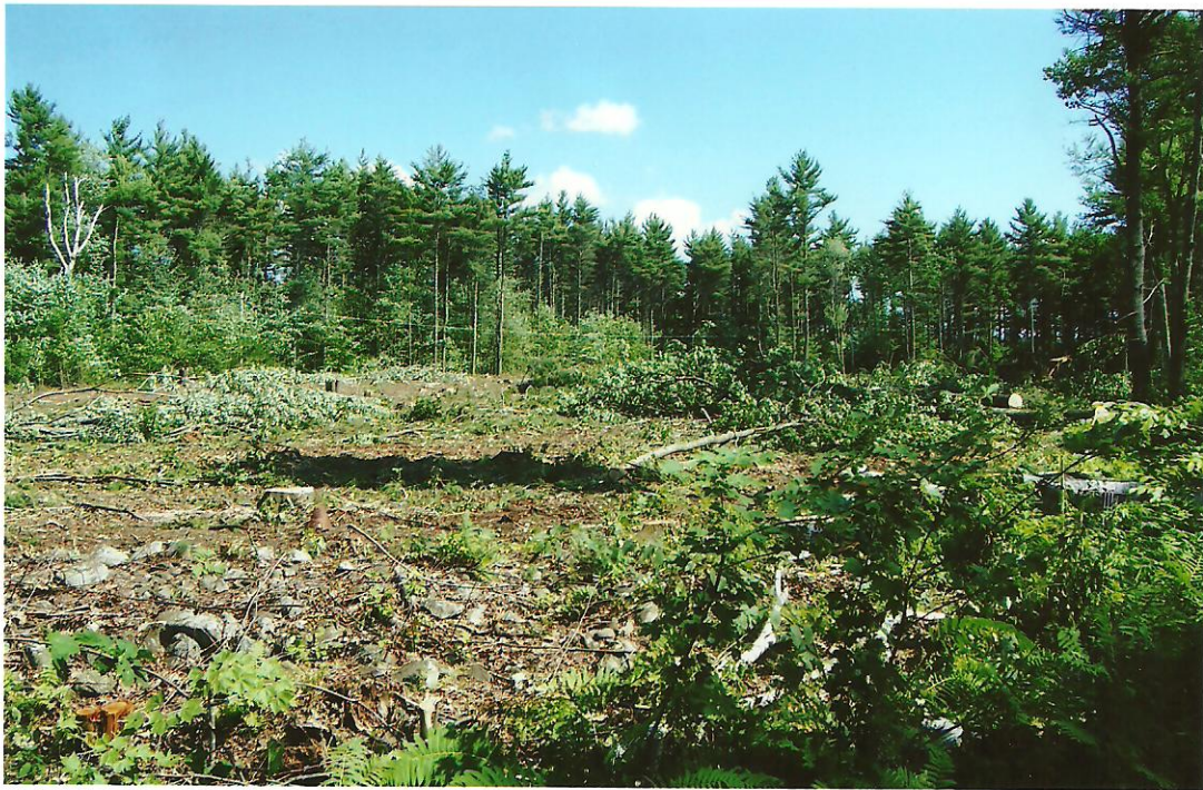
July 19 th , 2005: Getting Excited Now.