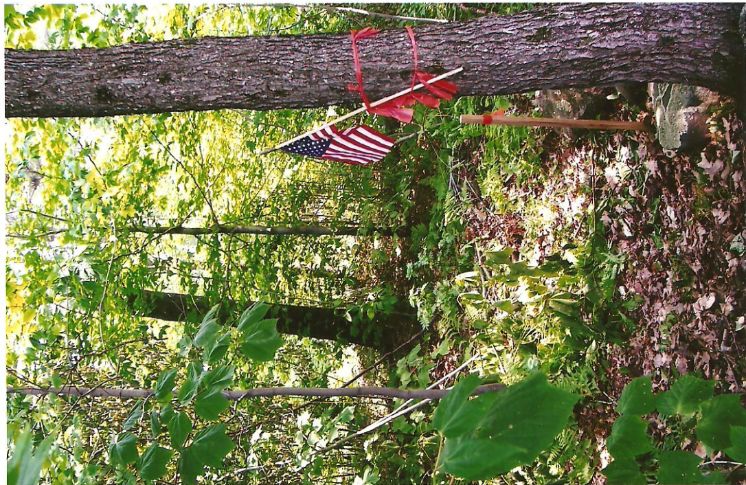
June, 2005: East To West Boundary-South End