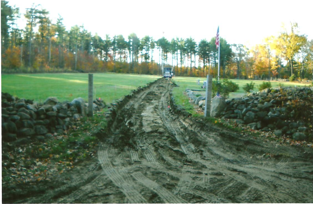
Hard-Top Ready For Another Rolling & Edging