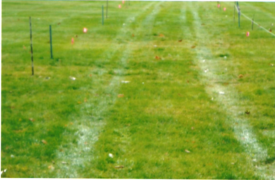
Shots Of The Roadway Position From The North Entrance and The South Exit