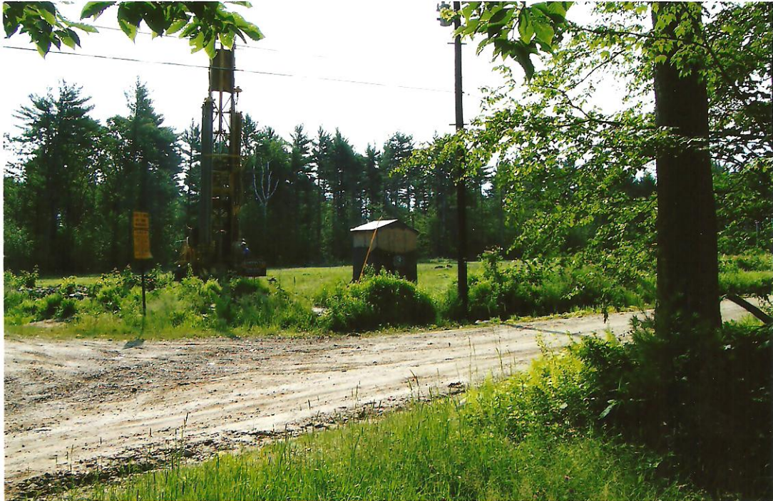
Drilling As Seen From Tower Hill Road