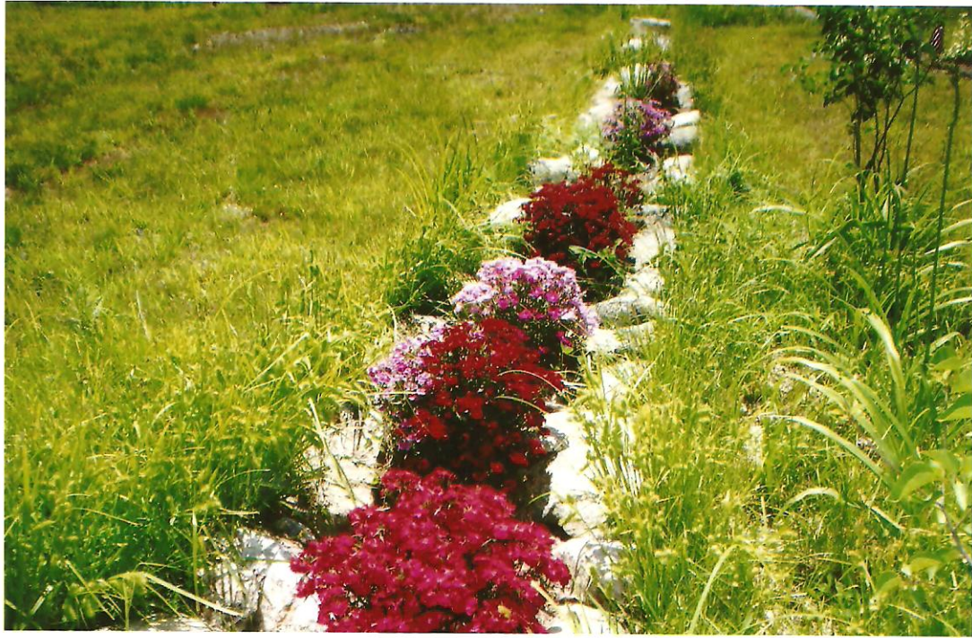
Gardens Flowers Are Beautiful Now