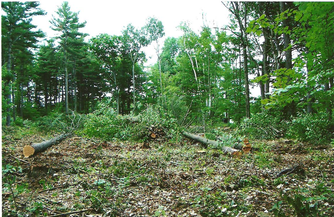
July 15 th , 2005: Second Day and Much Cleared