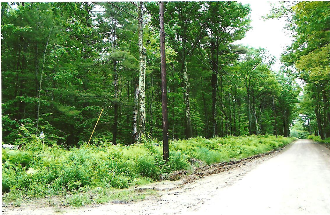
June 14 th , 2005: Corner Of Tower Hill & Rufus Colby Roads.