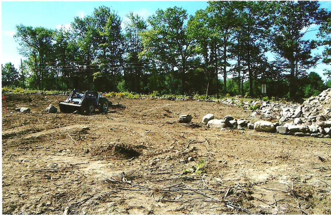
Aug 23 rd , 2005: Setting Out The Memorial Gardens.