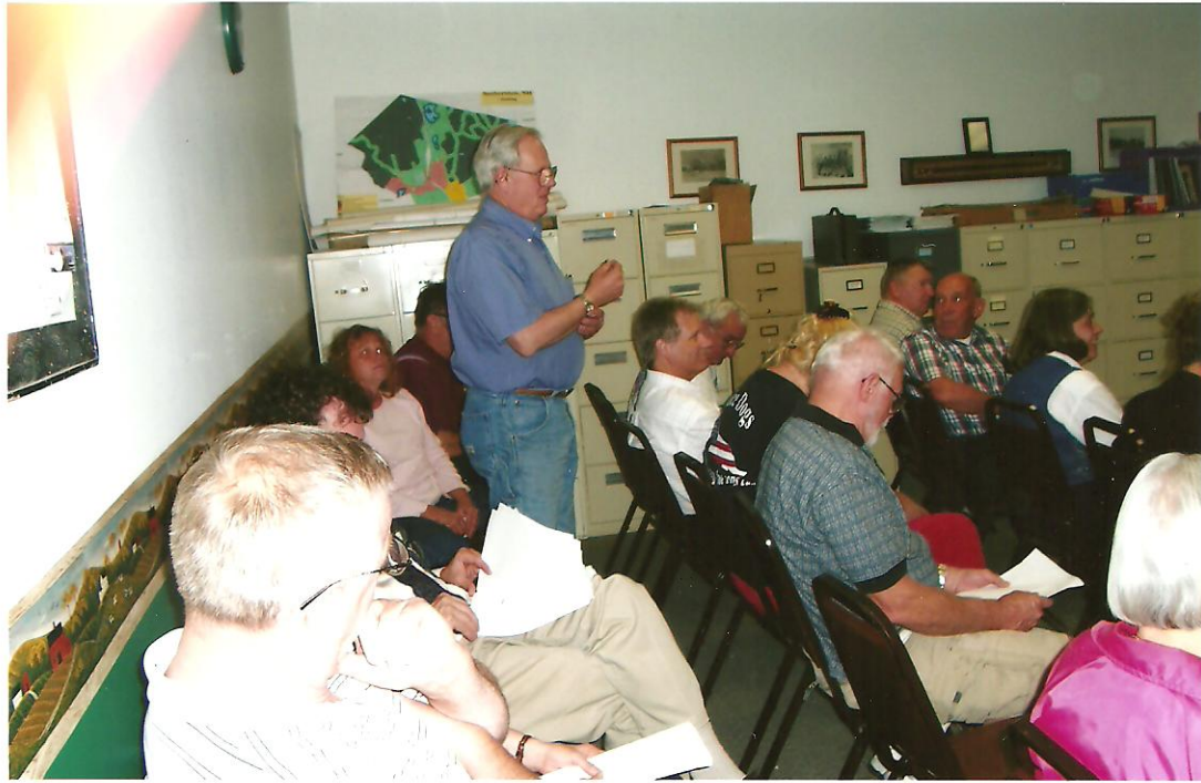
June 22 nd , 2005: Interested Residents Listening Intently.