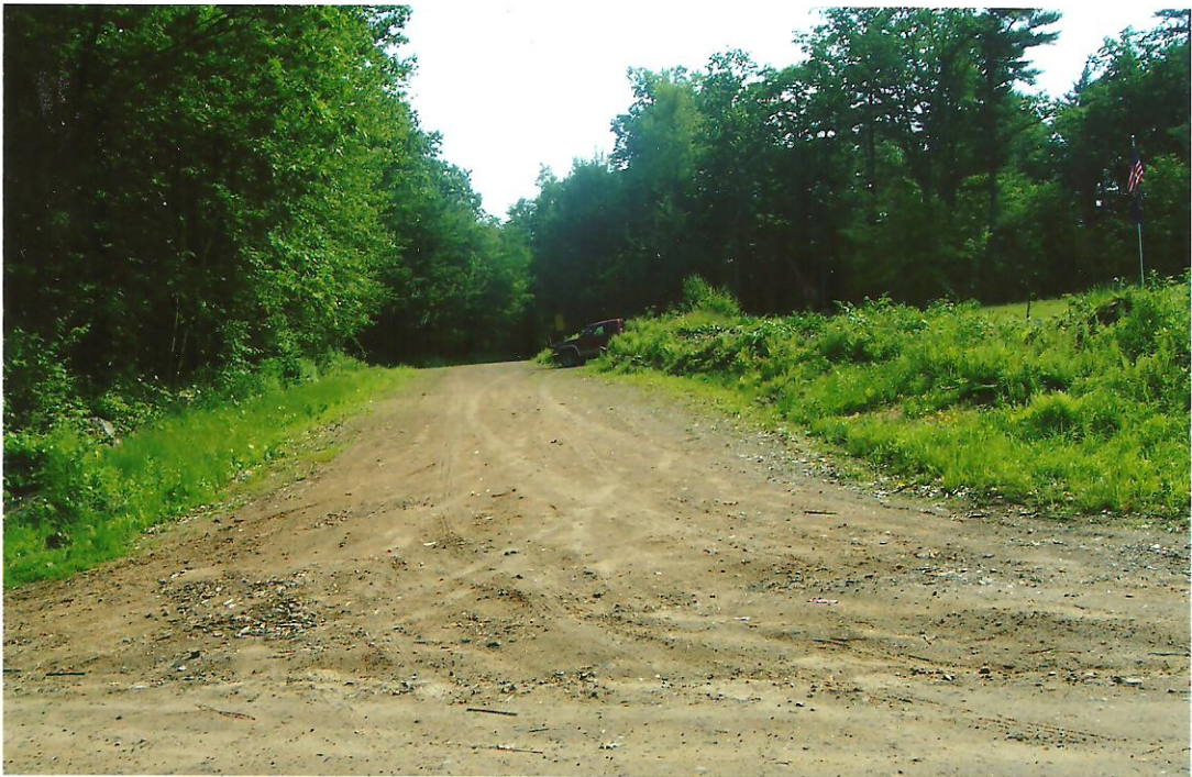
June, 2008: Rufus Colby Road, Upgraded To Class 5