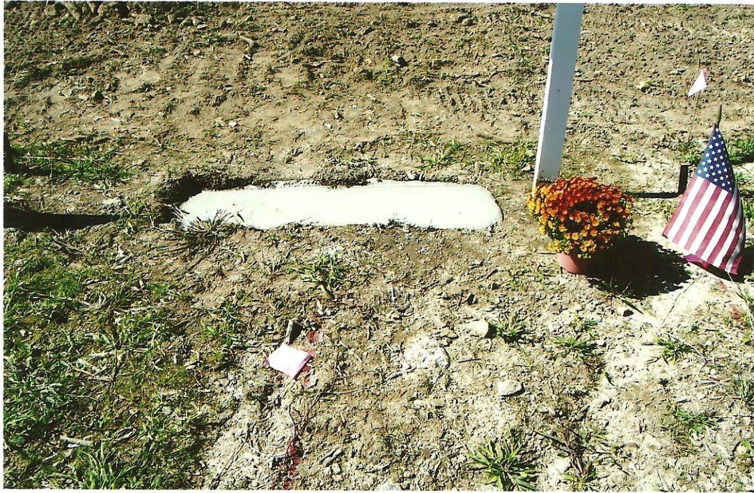
Aug, 2008: Headstone Base Is Ready