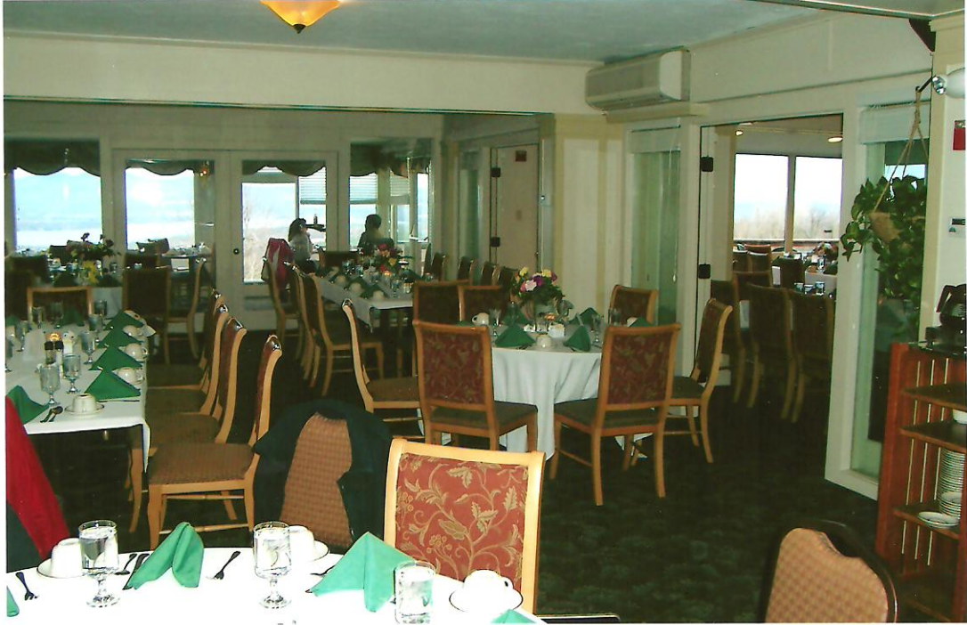
General View Of The Room