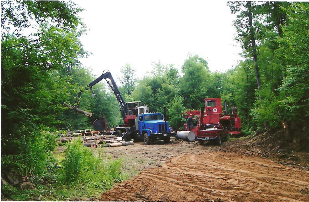
July 15 th , 2005: Setting Up On Bodwell's Landing