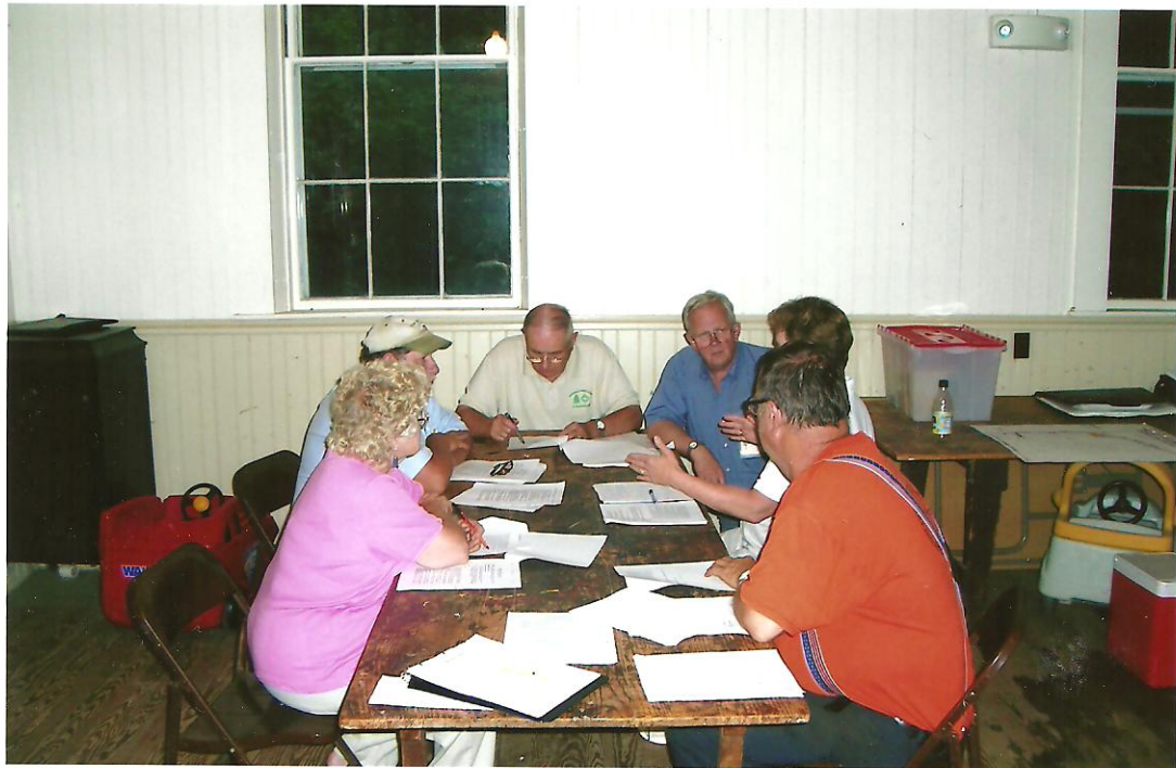
June 30 th , 2005: Rules & Regulations Group