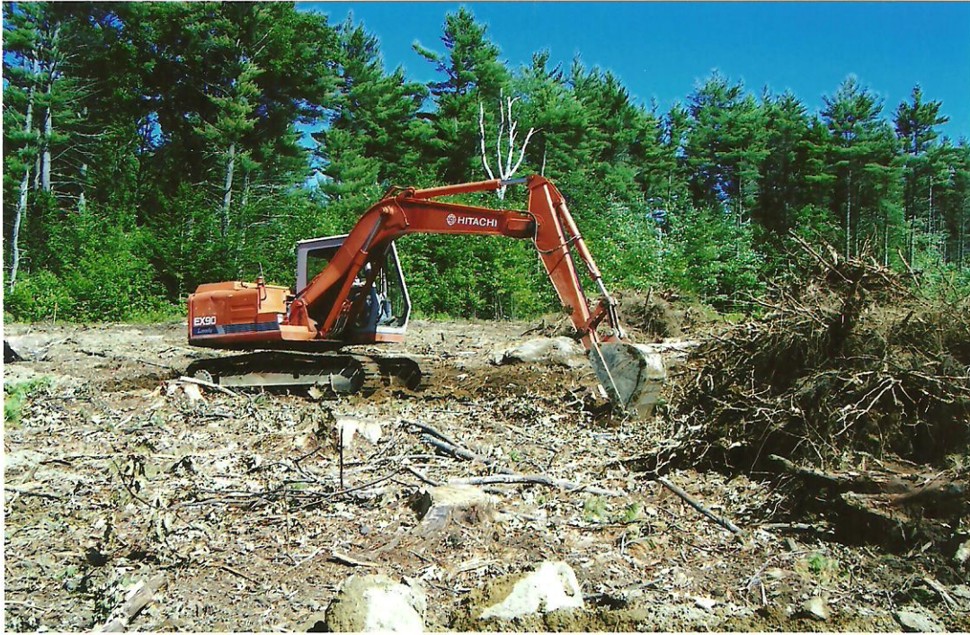
July 24 th , 2005: The Stumps Are heavy