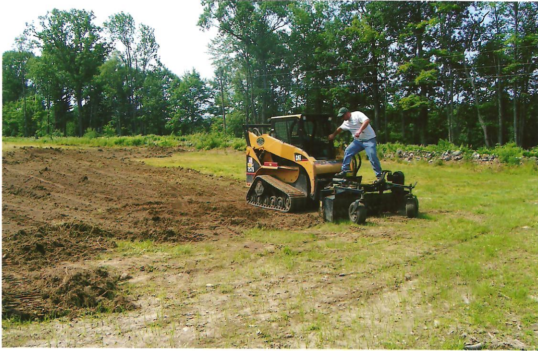
Aug, 2008: The Levelling Begins Salmon Falls Is The Contractor