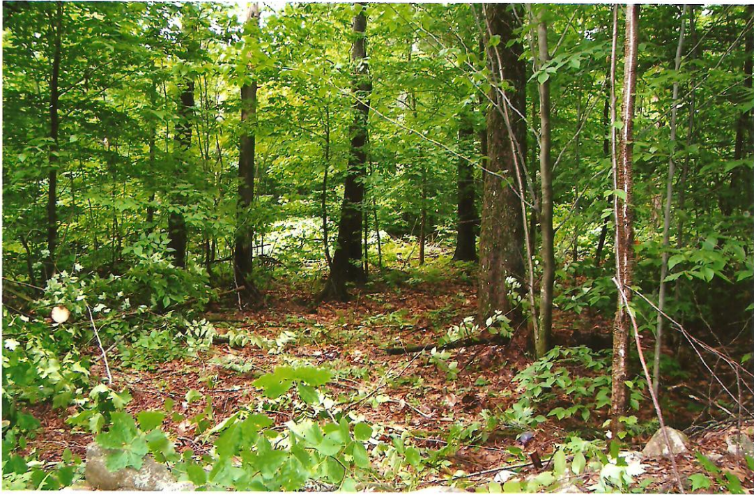
June 14 th , 2005: Cut A Few Trees, Then Start Moving Rocks