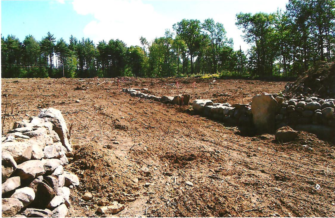
Sept 9 th , 2005: Memorial Garden Taking Shape