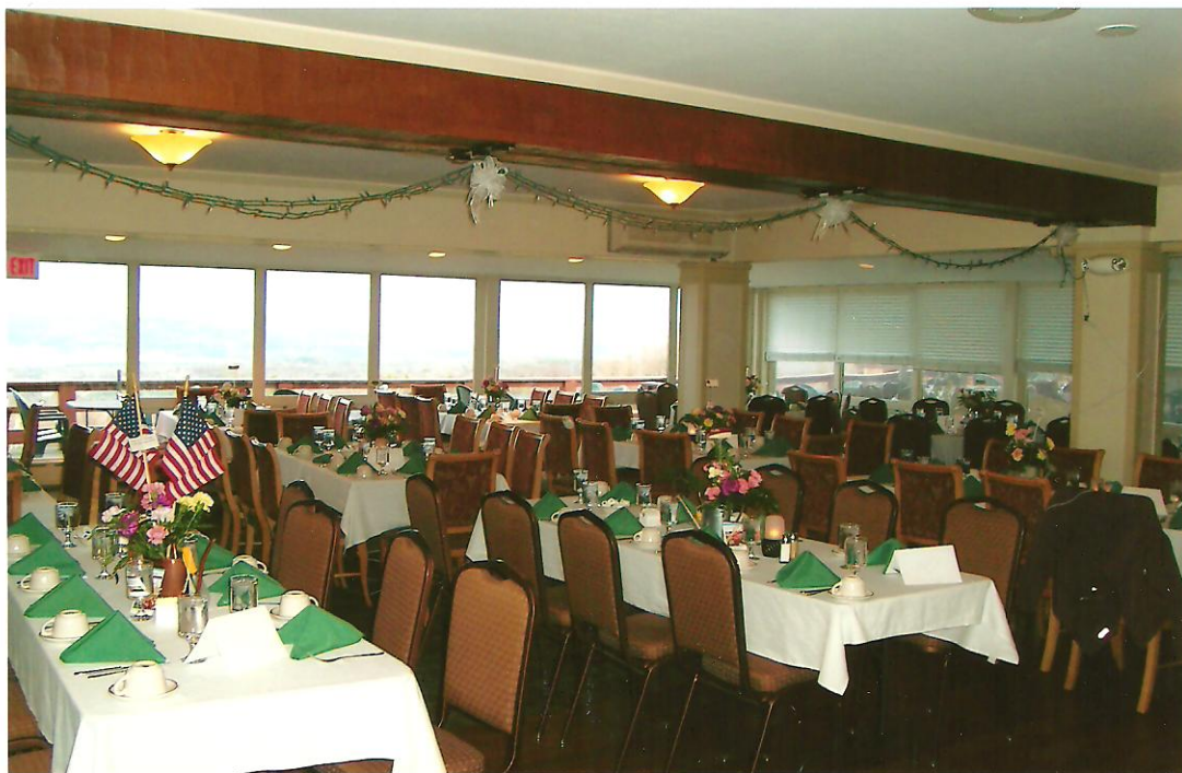
Waiting To Have A Great Evening