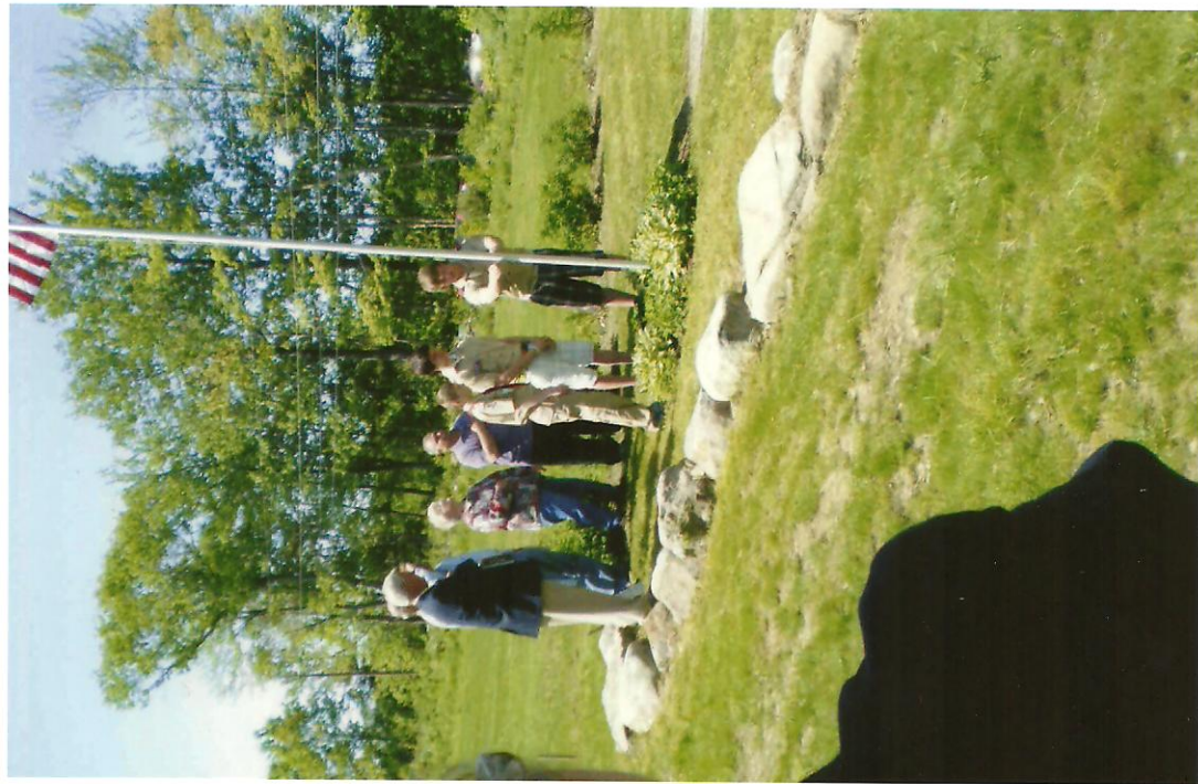
The Sanbornton Boy Scouts Troop Raise The Flag