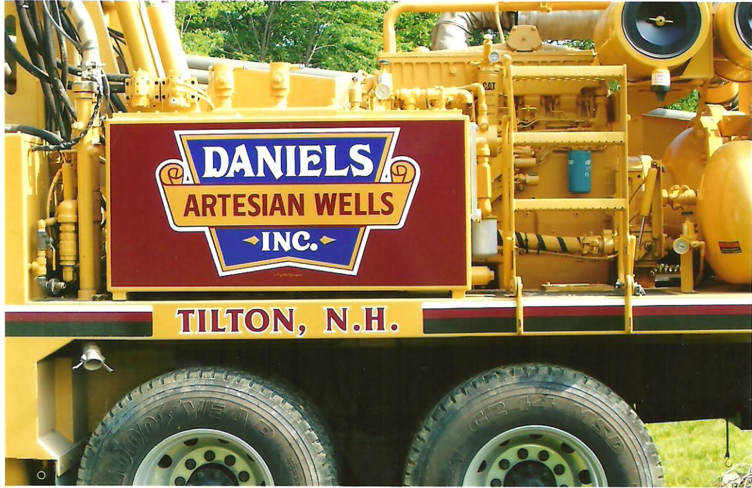
Good Advertising !