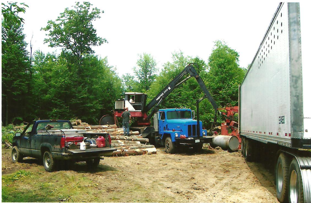
July 18 th , 2005: Cutting And Chipping