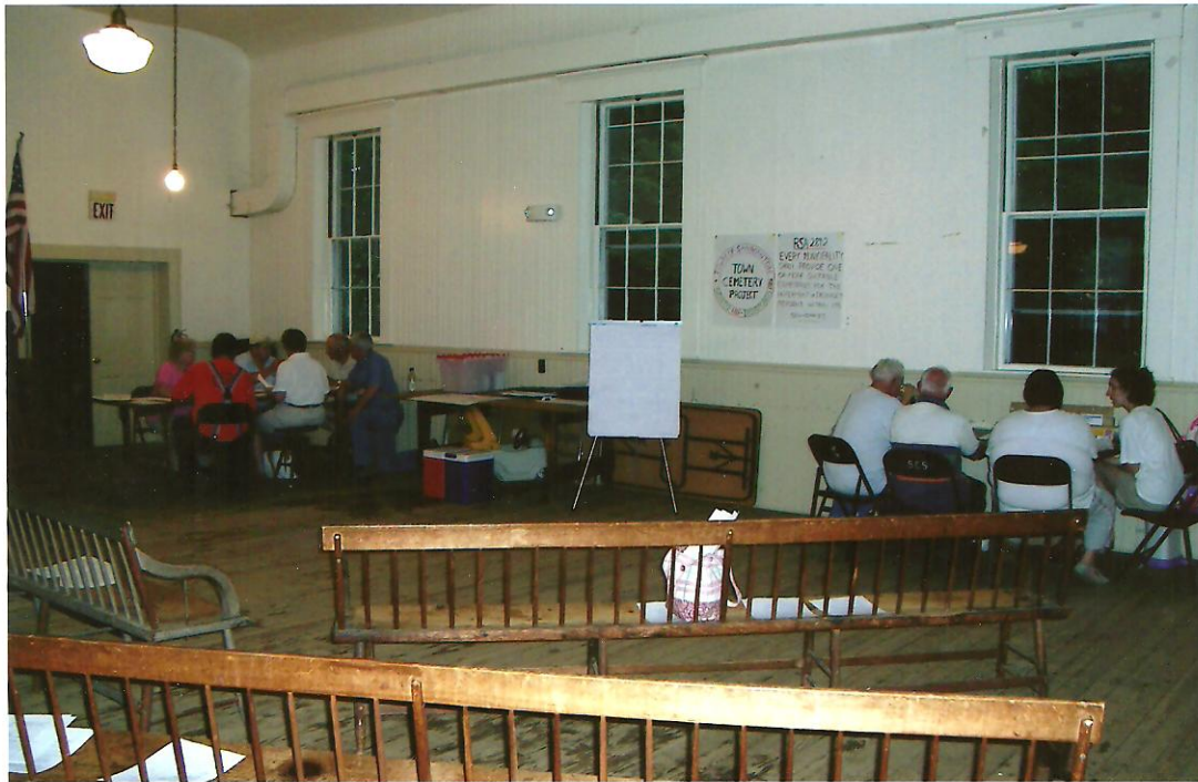
June 30 th , 2005: Town Hall Group Meeting