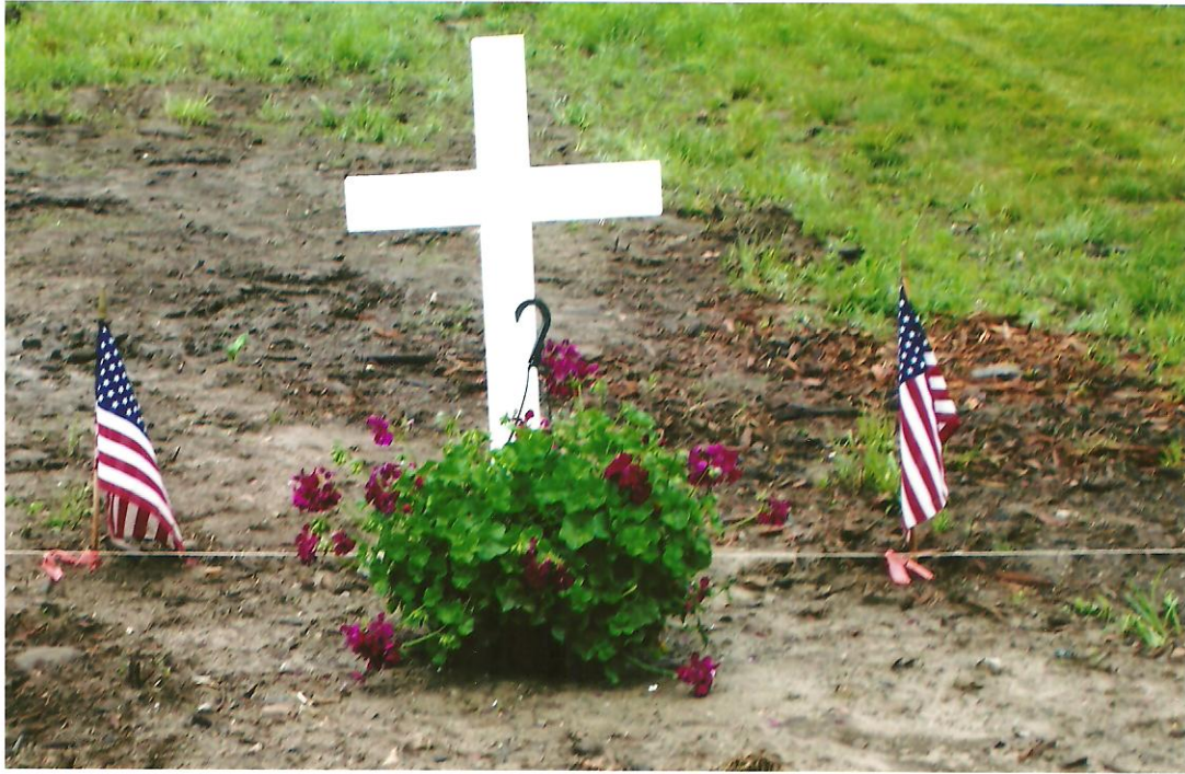
June 7 th , 2008: First Burial Complete With Temporary Cross