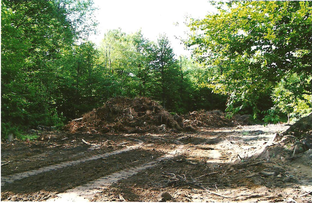
Aug 22 nd , 2005: Thanks to the Bodwell's For Use Of Their Landing