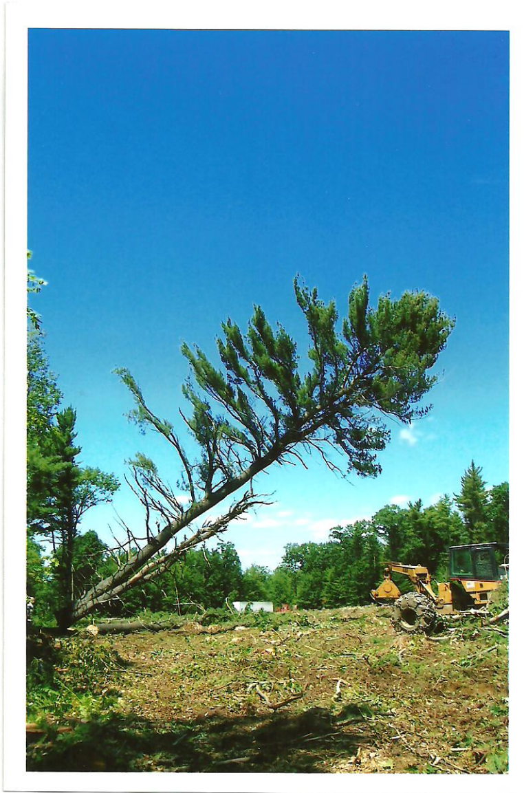
July 21 st , 2005: The Last Trees Are Coming Down.