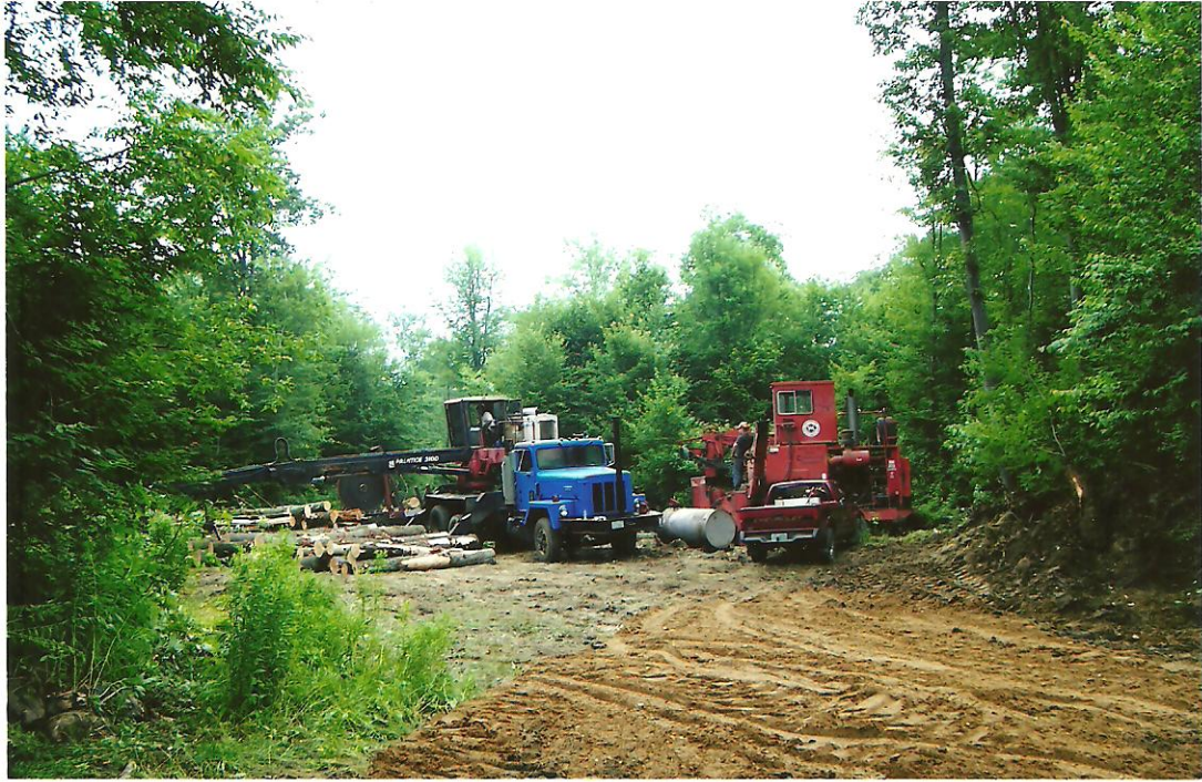
July 18 th , 2005: Staging And Cutting On "Bodwell's Landing"