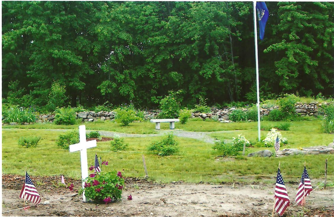
June 7 th , 2008: A View Of The First Grave And The Memorial Garden