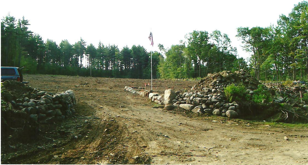
Sept 13 th , 2005: Our Country's Flag Is Flying Over The Cemetery