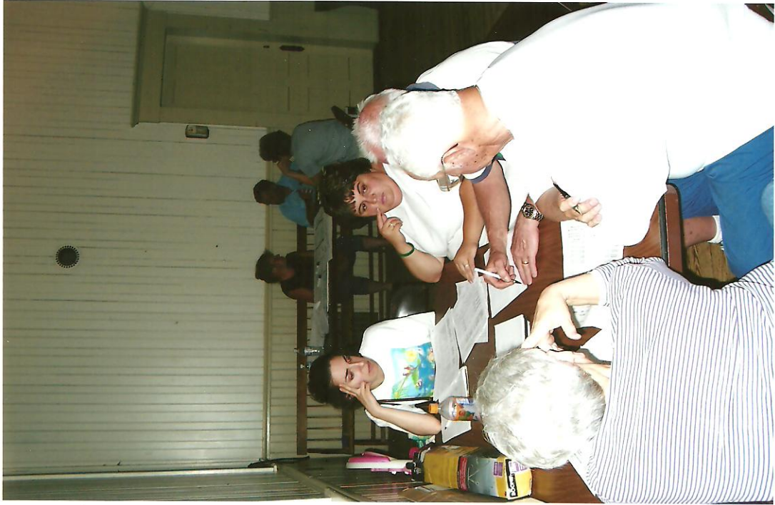
June 30 th , 2005: Pricing Group.