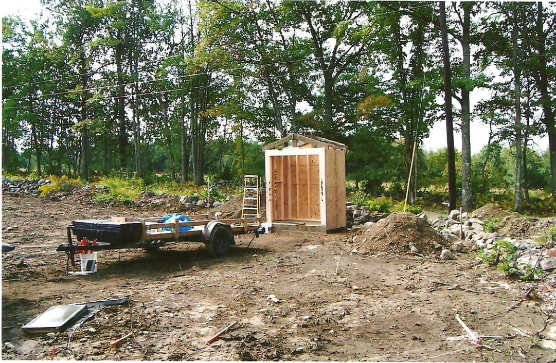
Sep 23 rd , 2005: Peter Erects The Shed For The Electric Power & Water Tank & Controls.