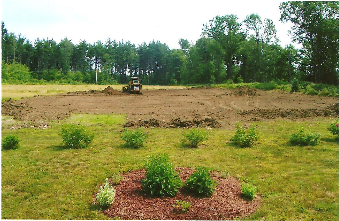
Aug, 2008: Levelling Continues-View from Gardens