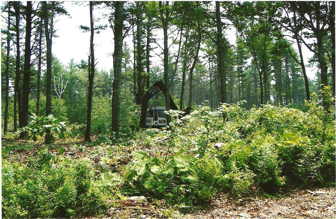
July 20 th , 2005: From Rufus Colby Road.