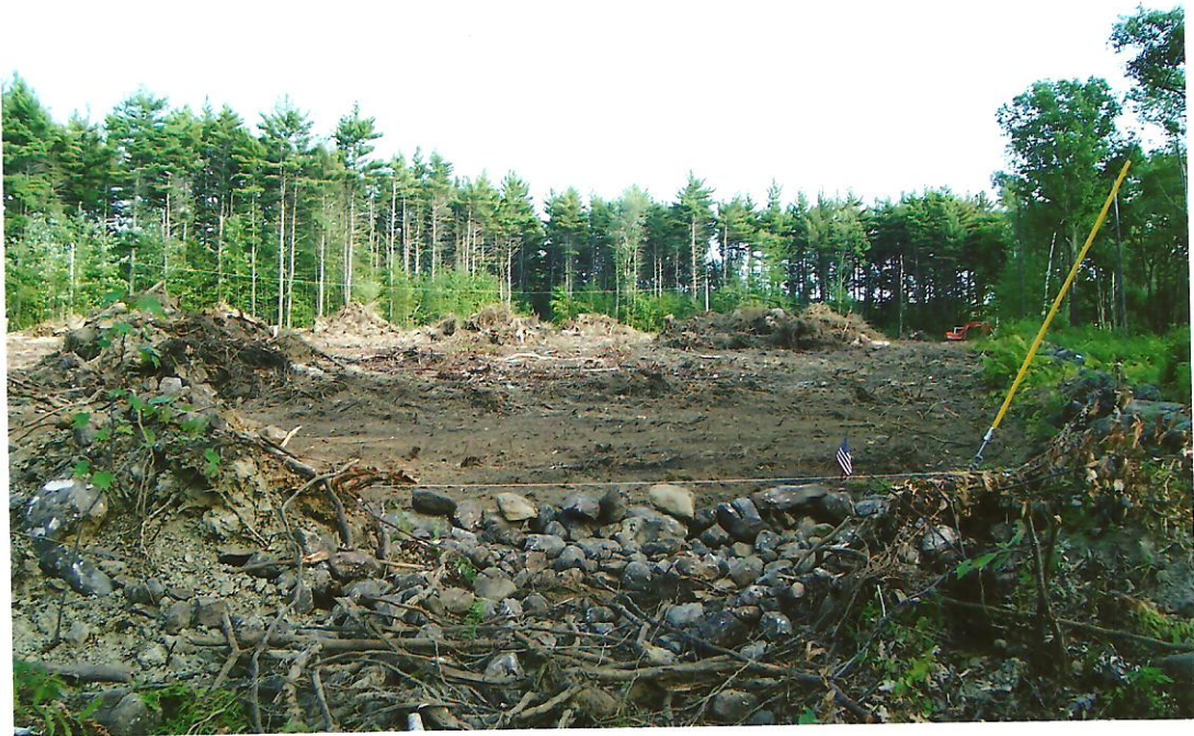
July 31 st , 2005: Thanks To The Tobin Family - Piles Of Stumps