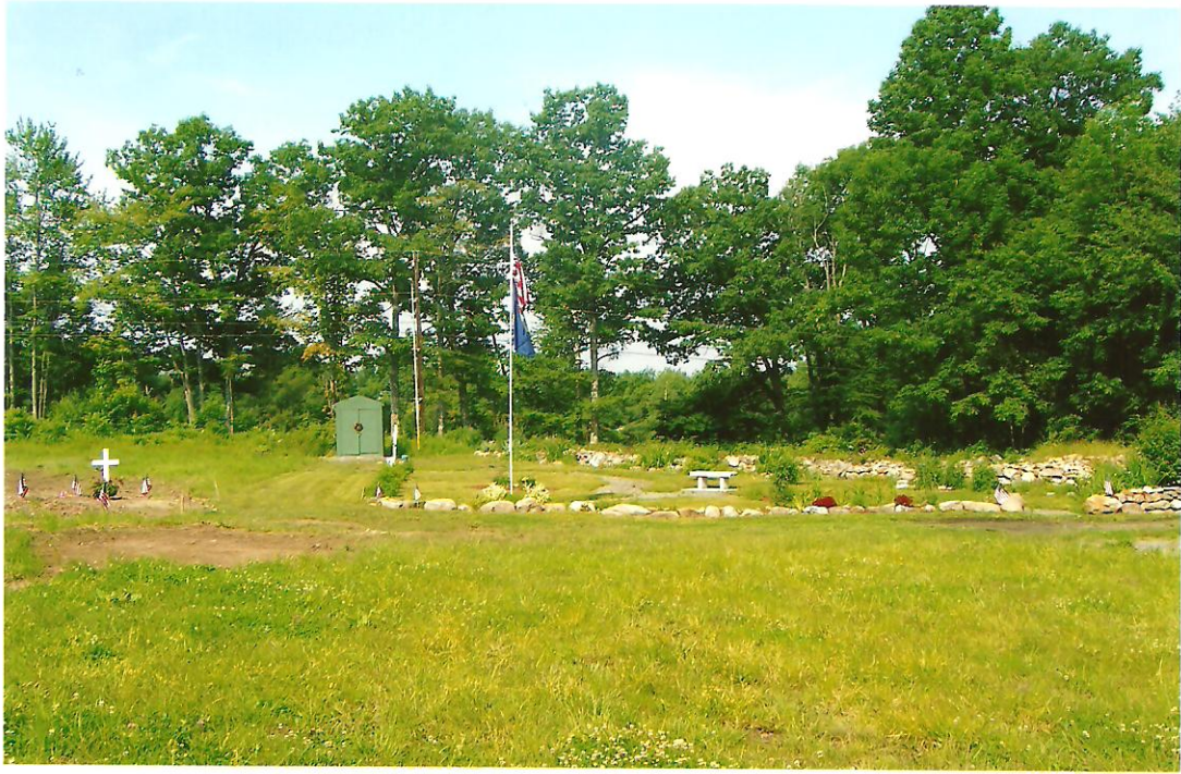
Views Of The Memorial Gardens