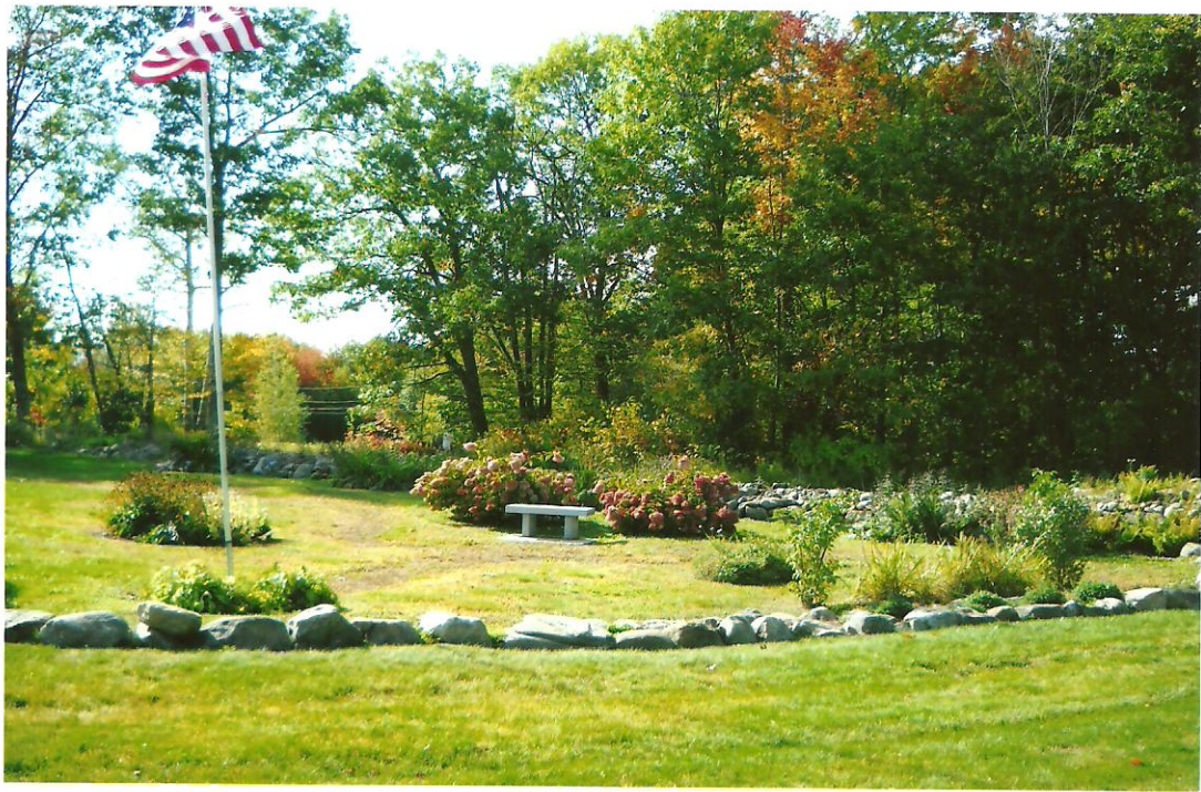
Gardens Are Looking Perfect As Shrubs Grow