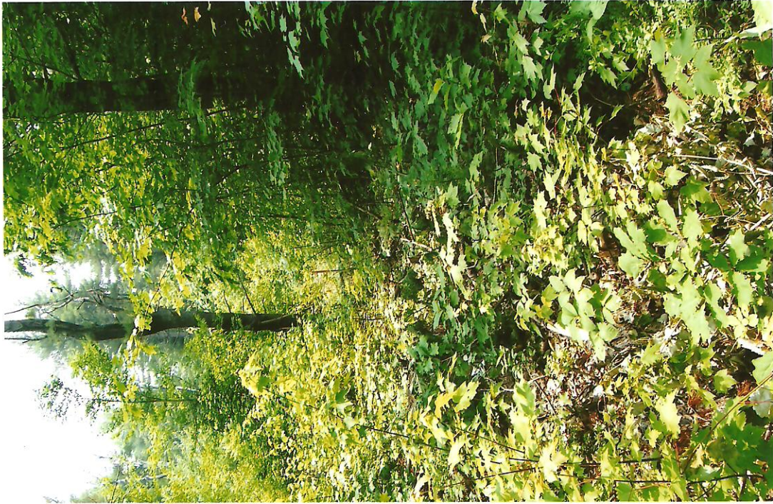
June, 2005: Marking Out The Boundaries