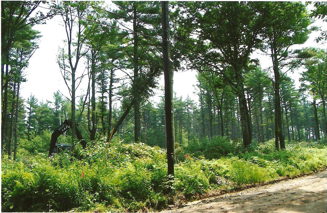
July 20 th , 2005: From Tower Hill Road.