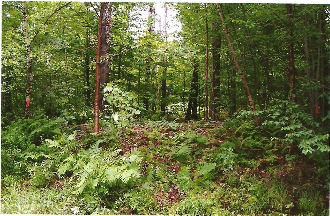
June 14 th , 2005: Try Here At The Entrance, I Guess