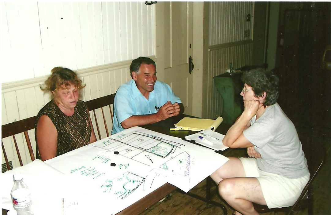
June 30 th , 2005: Memorial Garden Group. The groups came back the next week to submit final suggestions.