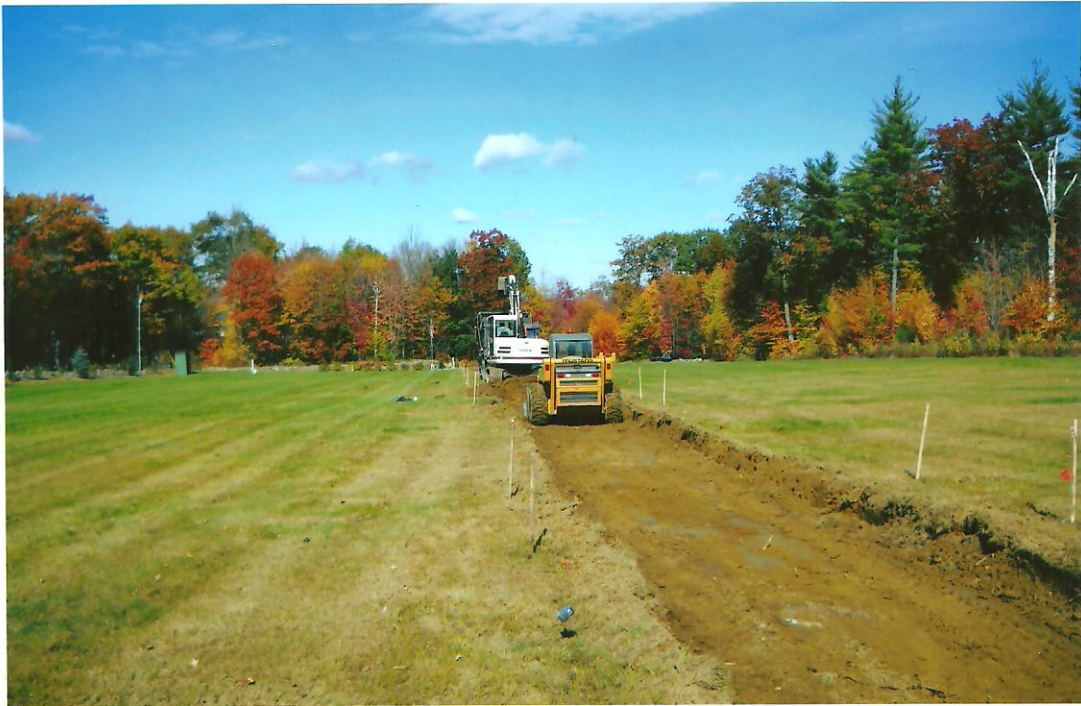
Constant Rolling and Leveling is Carried Out