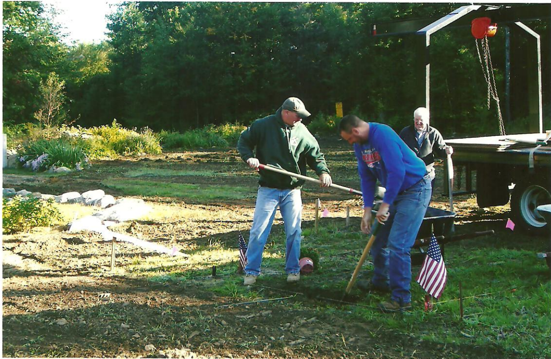
Aug, 2008: Digging For The Headstone Base.