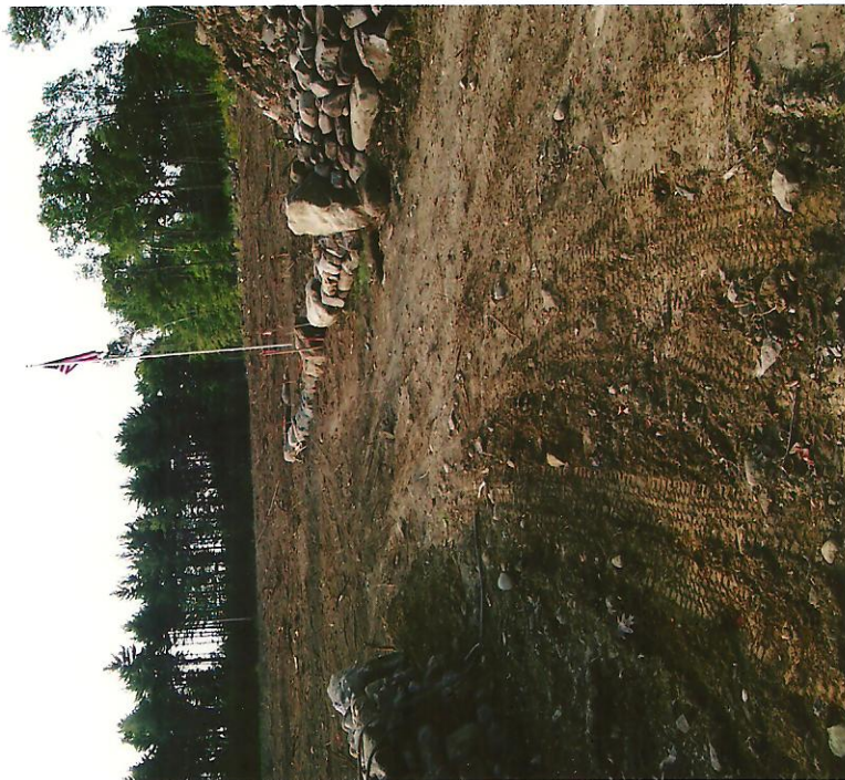
Sep 13 th , 2005: Starting To Look Great