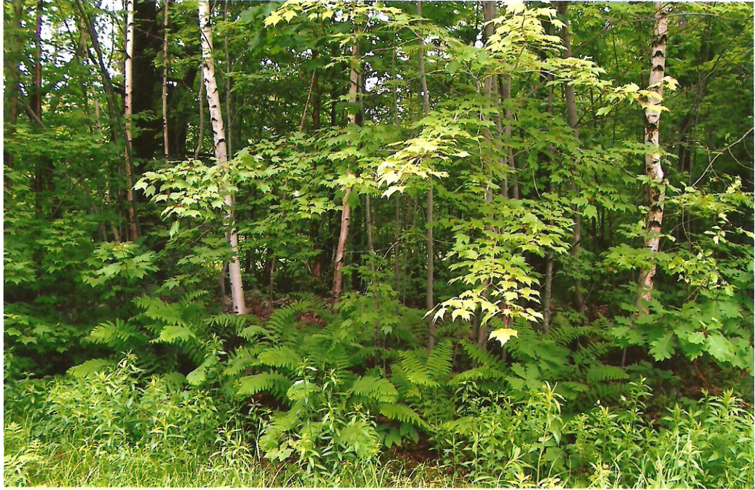
June 14 th , 2005: Where Do I Begin ?