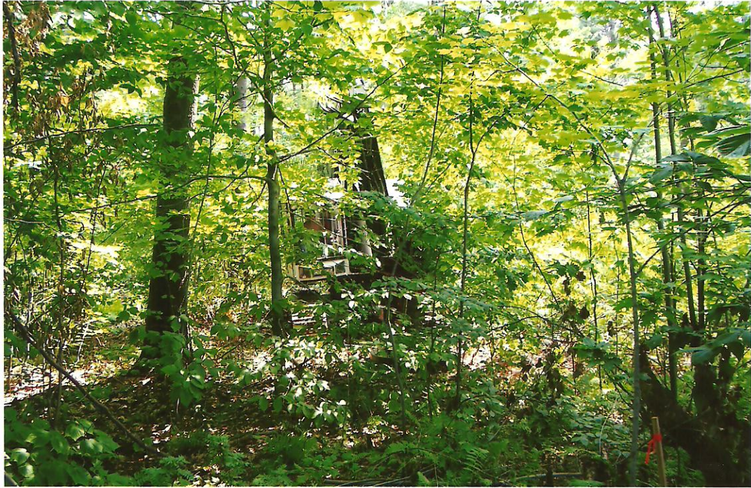
July 14 th , 2005: Cutting the South End