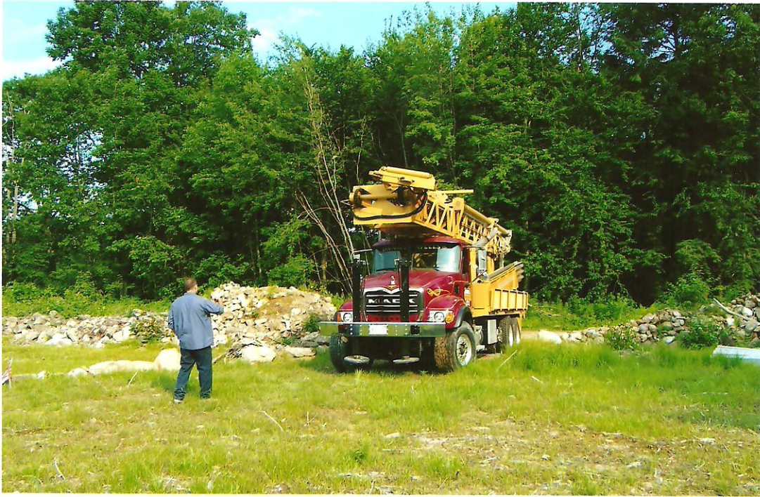
Daniels Artesian Wells Inc., Drop In