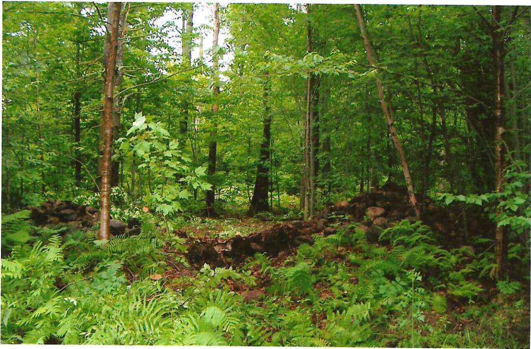
June 14 th , 2005: These Rocks Are Heavy After A Couple Of Tons.