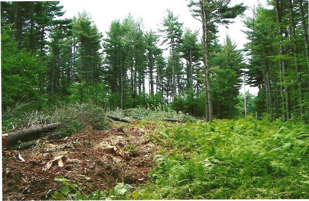
July 15 th , 2005: Under The Power Lines.