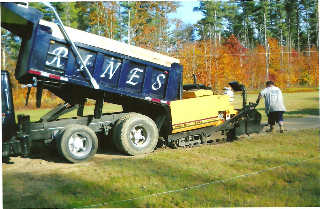
Laying The Top 6 inches of Hard-Top