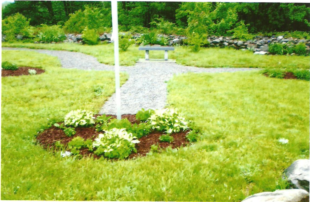
The base Of The Flagpole, Showing Winding Path And Bench