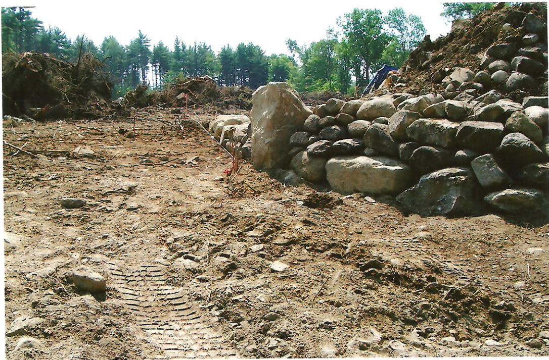
July, 2005: During The Stump Removal, Peter Hibberd Starts To Re-Build The Entrance Walls