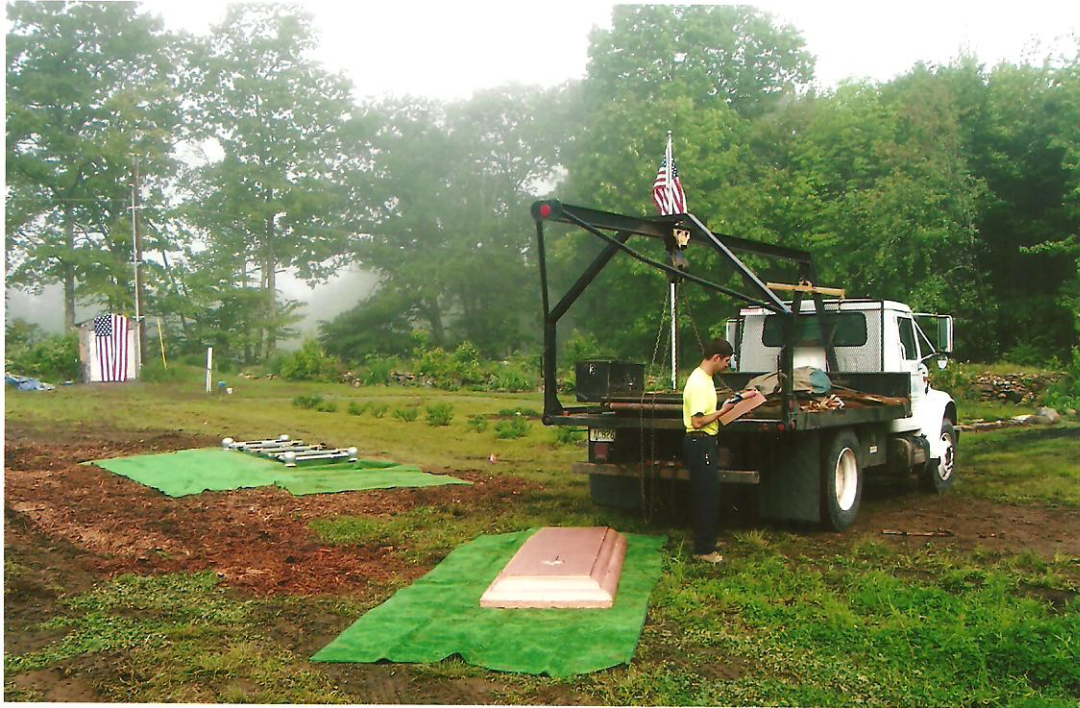
June 7 th , 2008: Installing The Concrete Vault.