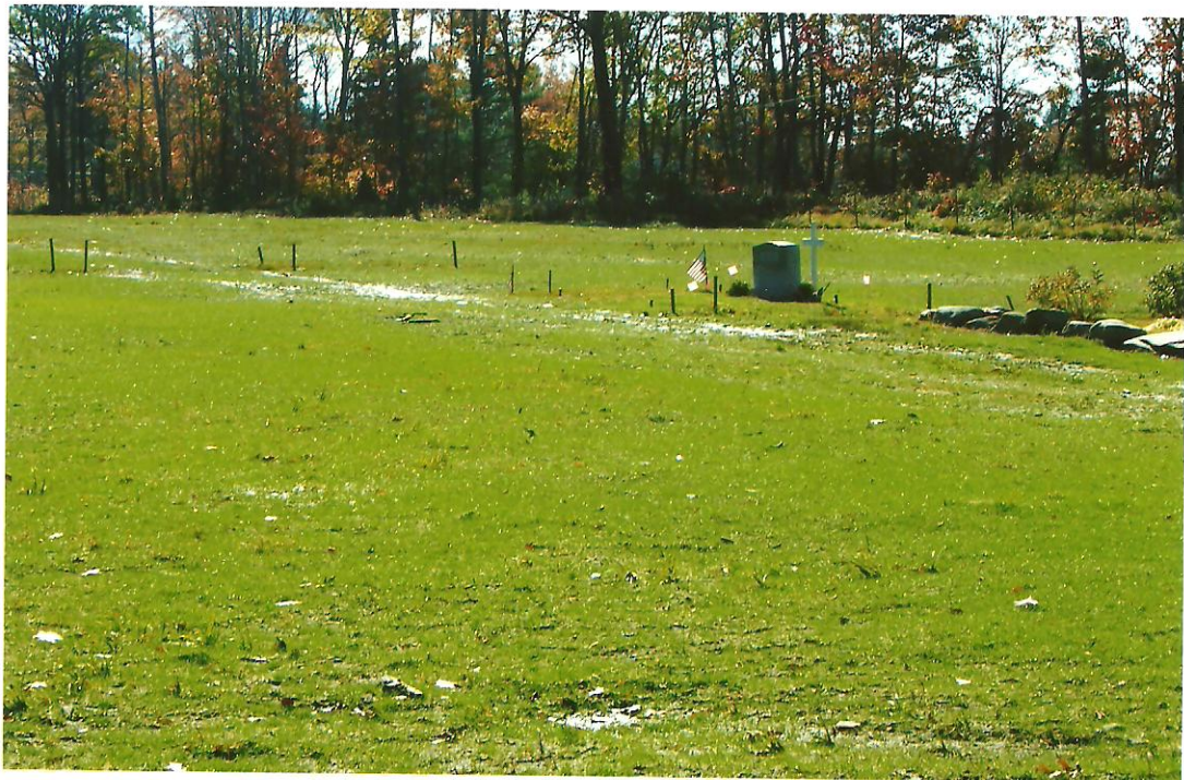
Aug, 2008: Headstone Has Been Installed