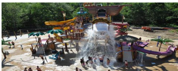
Whale's Tale Water Park